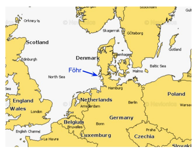
Föhr is located west of the border between Germany and Denmark.

degrees to port and to head back into the deep water so that the ferry could use the whole channel.