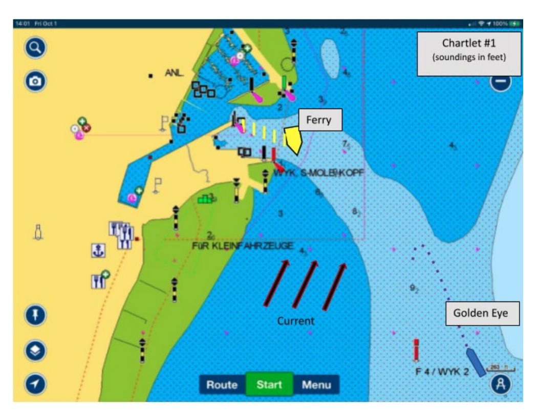
Chartlet 1, showing the narrow, largely unmarked channel and the initial positions of the two vessels.

Once the ferry gathered way, she was able to head more directly out of the channel. I had no idea what course the ferry wished to follow once outside the channel and again decided to stay out of her way by moving as fast as possible to the south side of the single buoy, completely out of the channel. By this time, the ferry had gained considerable speed, and we were unable to get beyond the buoy before the ferry altered course to port and we passed starboard-to-starboard.