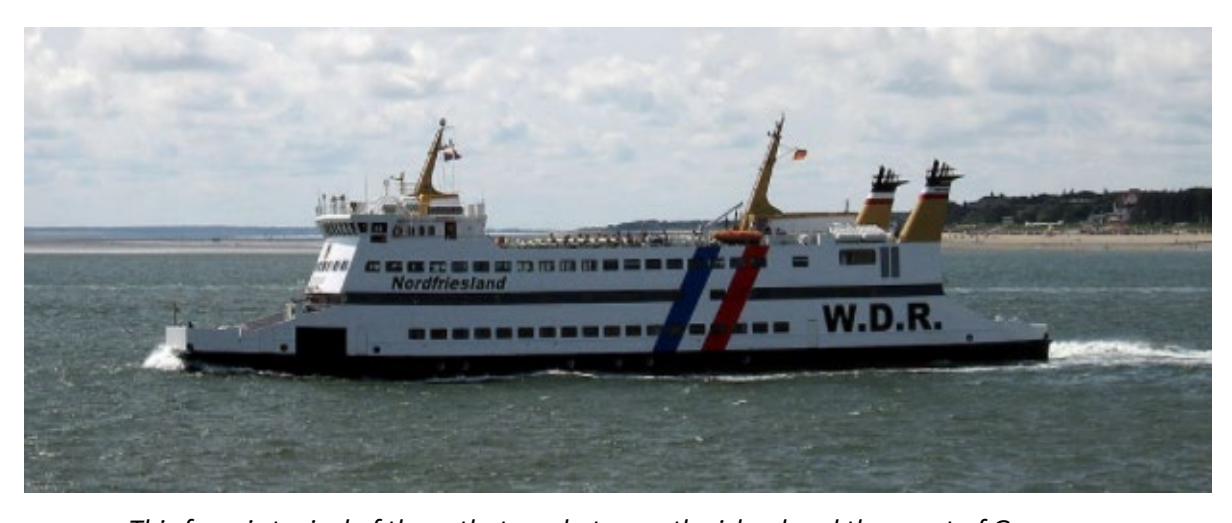
This ferry is typical of those that run between the island and the coast of Germany.

The Cruising Club of America is a collection of passionate, seriously accomplished, ocean sailors making adventurous use of the seas. All members have extensive offshore boat handling, seamanship, and command experience honed over many years. "School of Hard Rocks" reports, published by the CCA Safety and Seamanship Committee, are intended to advance seamanship and help skippers promote a Culture of Safety aboard their vessels