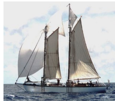
Topsail Schooner 'Appledore'

The Lalannes, in a humor-spiced presentation, explained that every sailing travelogue is dull if it fails to include "storms, sharks and pirates." Their voyage had all three.