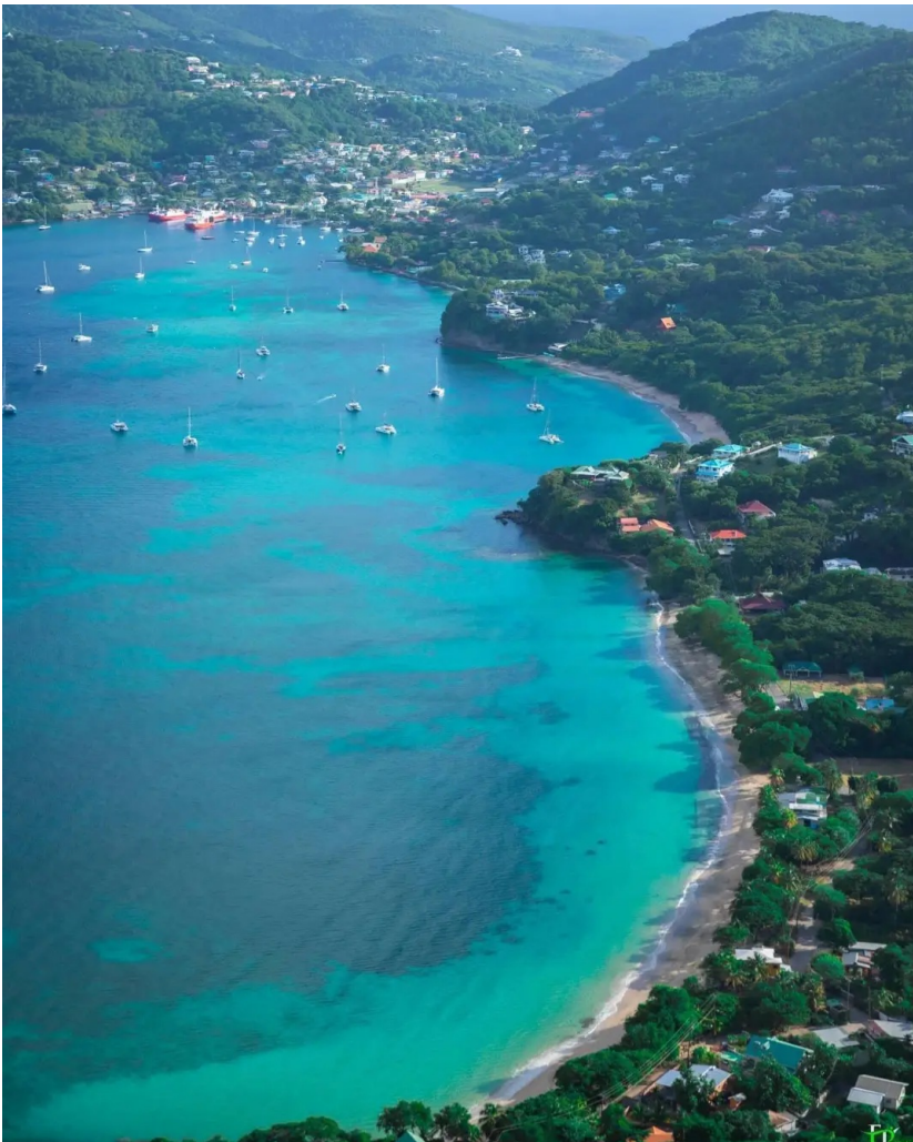
Admiralty Bay, Bequia

The Proposed Itinerary is posted on the 2026 Grenadines Cruise page on the CCA website with additional information and a link to register preliminary interest and join the email list for cruise updates. ( hot link).