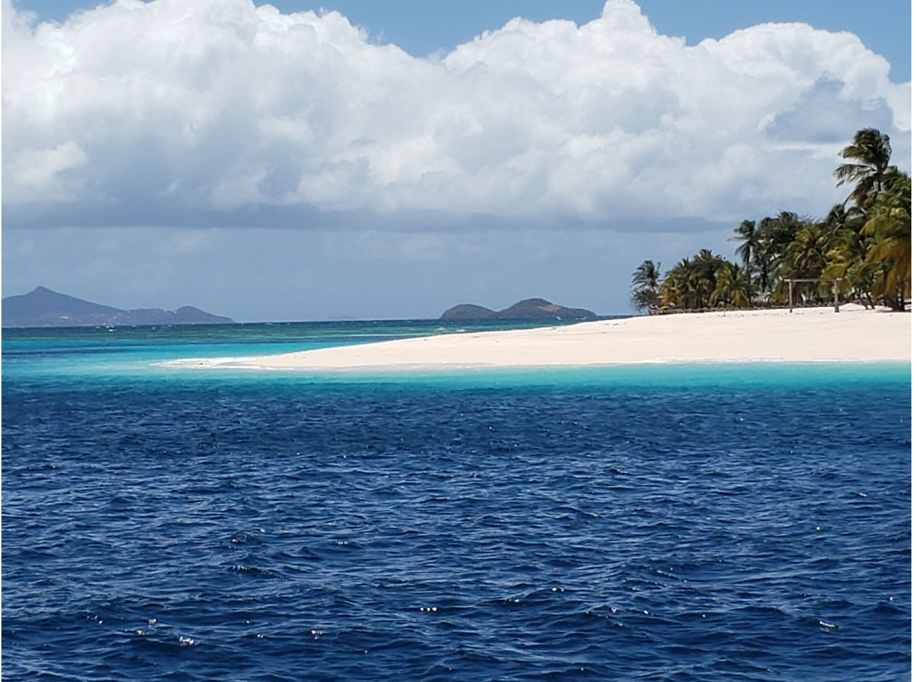
Palm Island, Grenadines