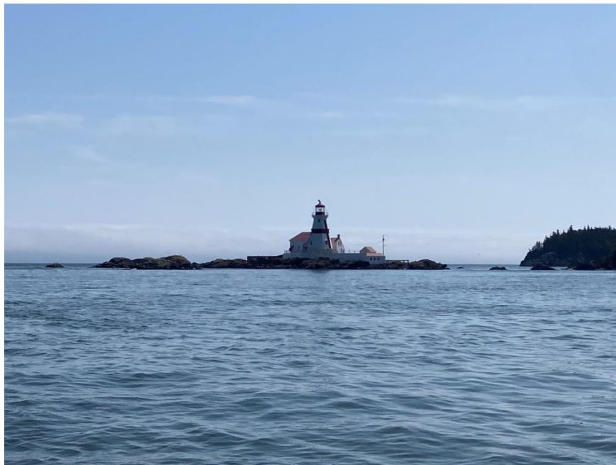
Head Harbour Light, Campobello Island

Given the almost limitless options for exploring and anchoring along this easternmost section of the Maine coast, the plan is to offer ample opportunity for “Captain’s Choice” destinations in the cruise itinerary.