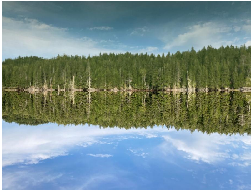
Moose Snare Cove

A one-way cruise is planned for several reasons. First, on a return toward Portland or points further south, cruise participants will have the opportunity to explore many other areas not experienced on the way east. And second, from Campobello/St. Andrews at the cruise's conclusion, cruise participants could also continue on for some wonderful cruising in Passamaquoddy Bay, the Bay of Fundy, or a short hop over to Nova Scotia.