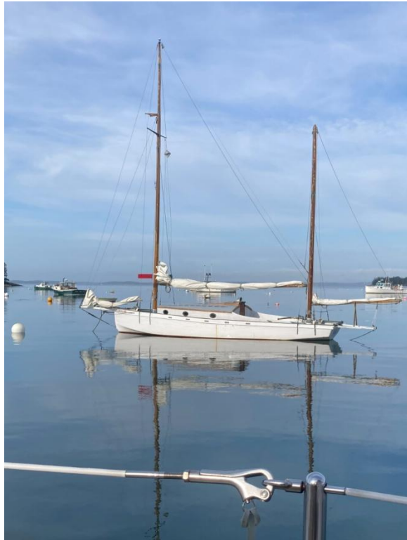
Burnt Cove, Deer Isle

The Downeast coast of Maine offers some of the best cruising in the world and we are excited to be working with our committee to make this cruise possible for the CCA.