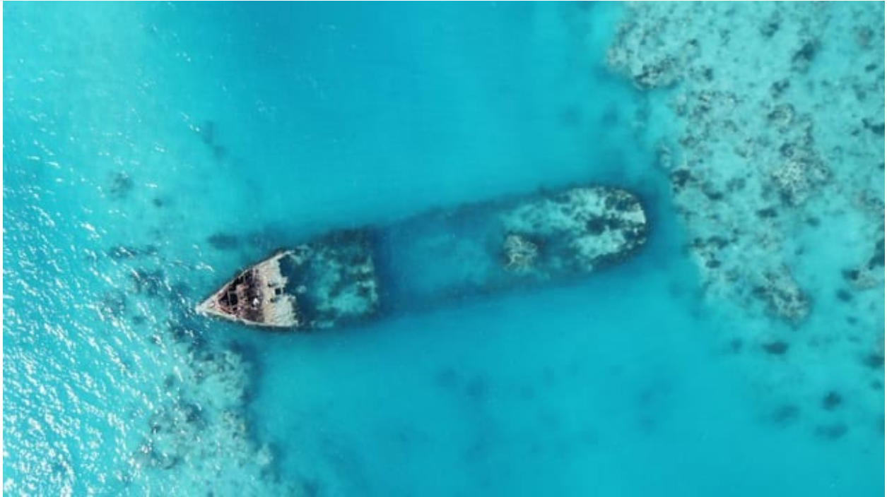
Wreck of the HMS Vixen, Bermuda - Sunk Intentionally to Block Chubb Channel from Enemy Submarines

HMS Vixen was an armoured gunboat. She was an experimental design incorporating revolutionary concepts. She had an armoured citadel which protected her machinery and her ram bow was reinforced by massive ironwork structures. No doubt this is why it still exists - 160 years after she was launched. Her hull was of composite construction, with iron frames and iron bulwarks and an outer cladding of 5.5 inches of teak over the entire hull. She was the first Royal Navy vessel to have twin propellers – massive two-bladed, 9 ft diameter screws. She was built at Deptford and launched in 1865. Total cost was £54,193.