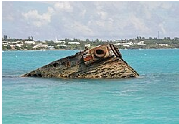
The wreck of HMS Vixen as it is today Daniel's Head, Bermuda

Once her engines had been removed, she was placed across the Chubb Cut and massive scuttling charges were detonated. Her keel was broken, and she settled in her final resting place in 10m of water just west of Daniel's Head, at the west end of Bermuda. She lies in a narrow gap in the coral reef, with the bow just above water. She is in a marine conservation area and is often visited by glass-bottomed boats as a tourist attraction.