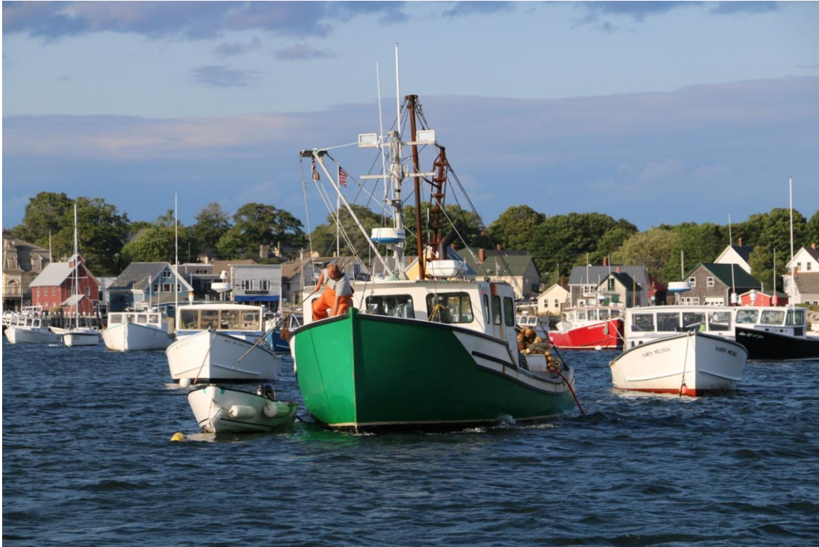
Carver's Harbor, Vinalhaven