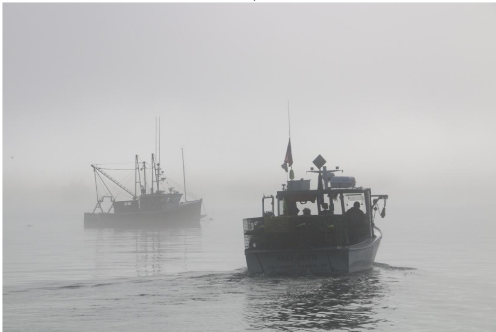
Fishing in the fog