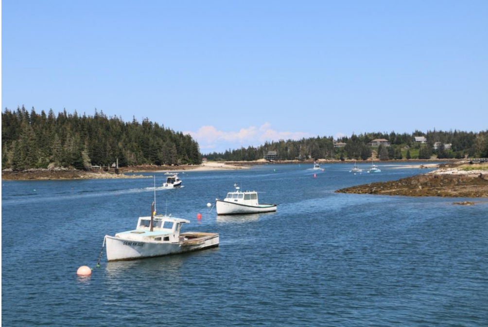
Isle au Haut Thorofare