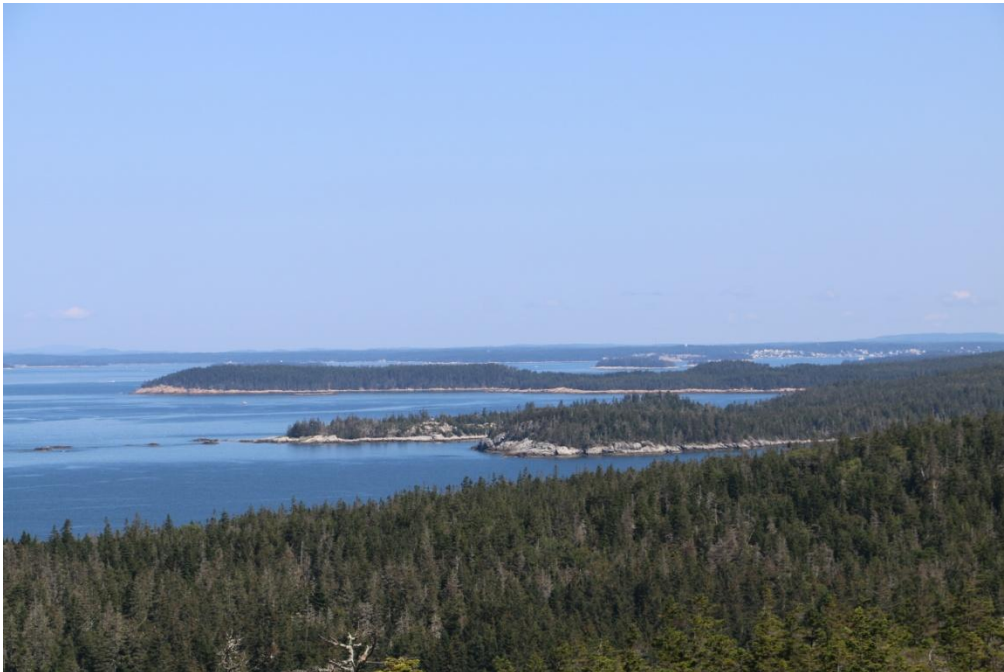
Isle au Haut looking toward Deer Isle