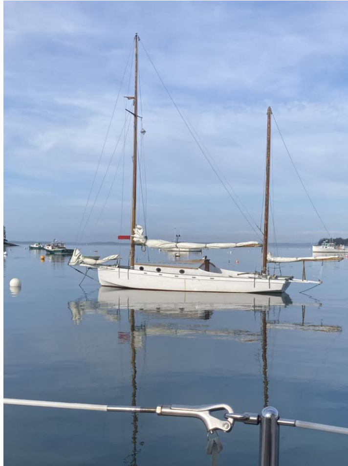
Burnt Cove, Deer Isle