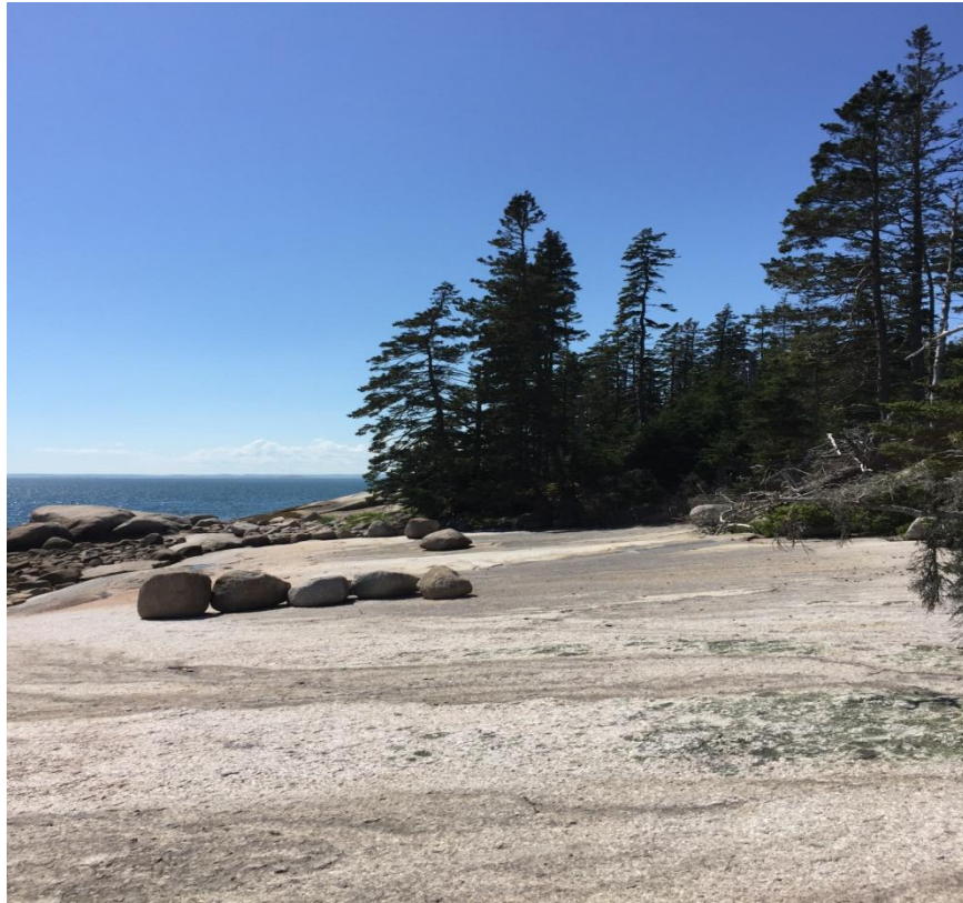
Wreck Island, Merchant Row