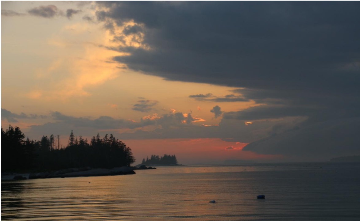
Merchant Island, Merchant Row