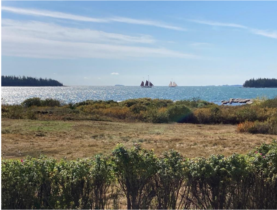
Windjammers in Deer Isle Thorofare