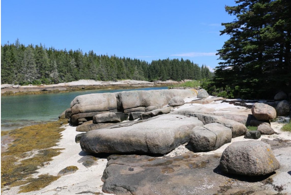
Coombs Island, Merchant Row