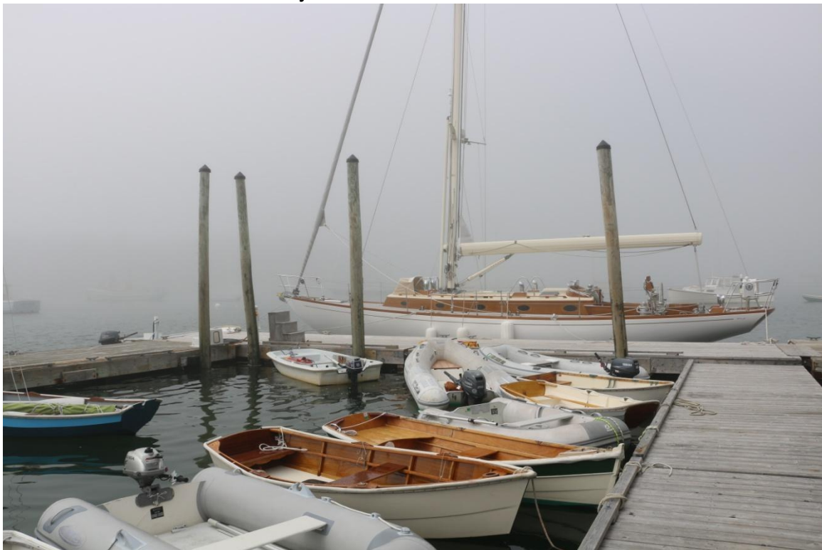
Brooklin Boat Yard