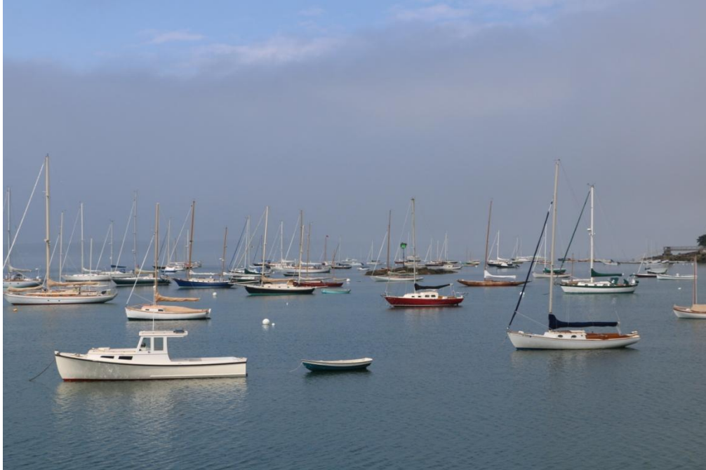
Babson Island Anchorage, Eggemoggin Reach