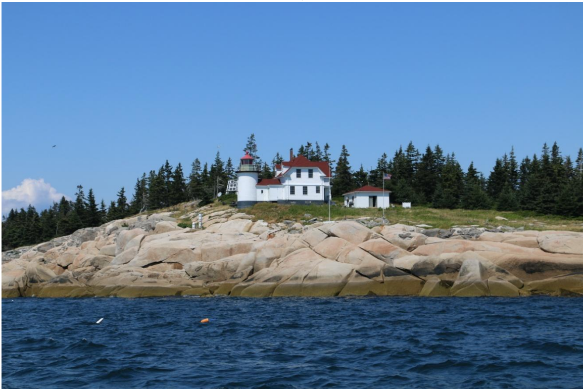
Heron's Neck Lighthouse, Vinalhaven