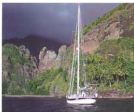
CHRONICLES OF THE CRUISING CLUB OF AMERICA