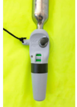
UML ProSensor inflator, one of several models used by Spinlock.Located on the left.

• Spinlock Deckvest lifejackets are available with two different inflators. One is located on the left side of the shroud, and one is located on the right side. There is no classic "jerk to inflate" lanyard pull; there's a rubber "handle" that pulls across your chest.