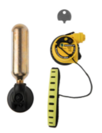
Hammar inflator showing the rubber lanyard pull for manual activation. Located on the right.