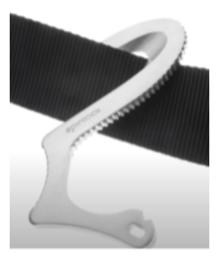
Spinlock S Cutter