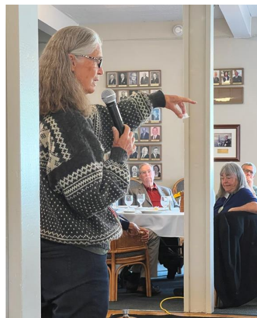
Rowen shows single-use plastic