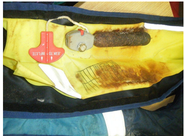
A corroded CO 2 cylinder may damage the inflation chamber, even if it somehow managed to retain pressure